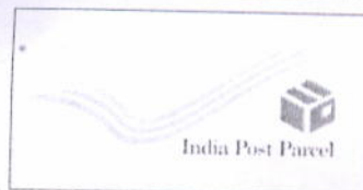
India Post logo