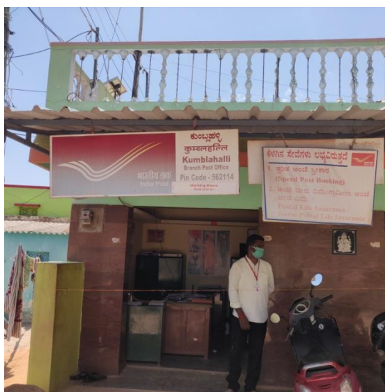
Pic 18: Kumbalahalli BO with its BPM