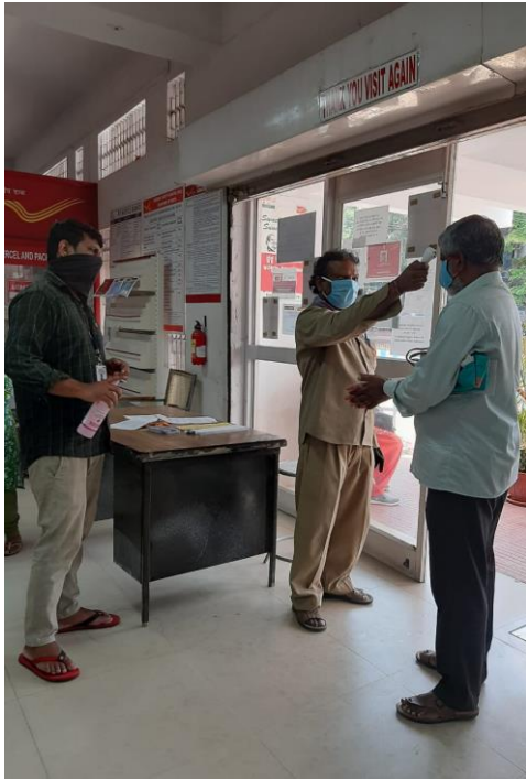
Pic 7: Thermal scanning at Basavanagudi HO