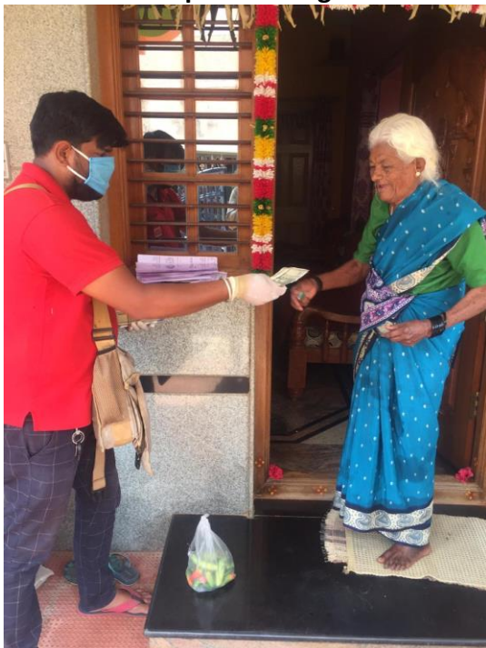
Pic 15: A visibly delighted customer