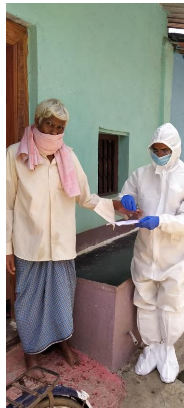
Pic 5: Payment of Social Security Pension MO