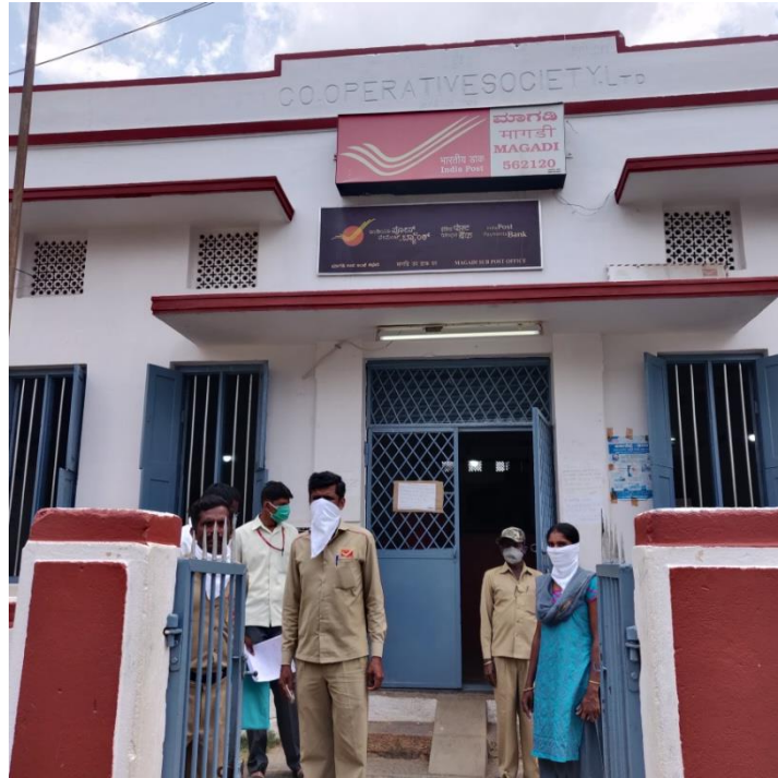
Pic 19: Magadi SO