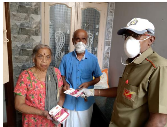
Pic 14: Doorstep service