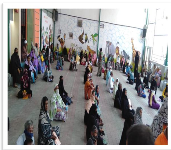
Pic 11: Payment of Social Security pension in school premises