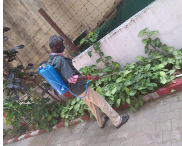
Pic 10: Sanitization outside office