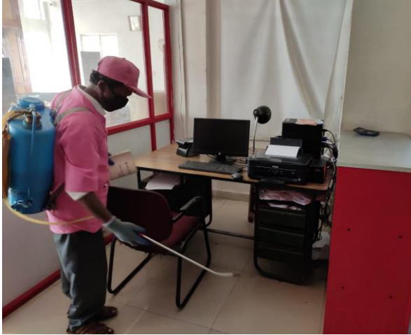
Pic 9: Sanitization inside office