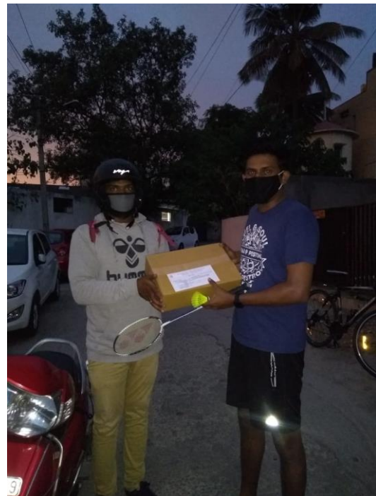
Pic 16: Twilight mango parcel delivery