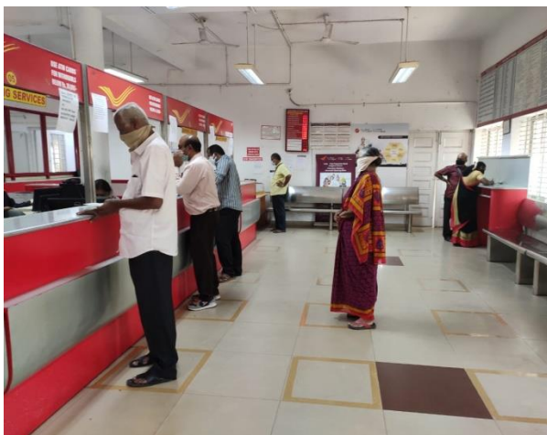
Pic 2: Floor markers to maintain physical distance