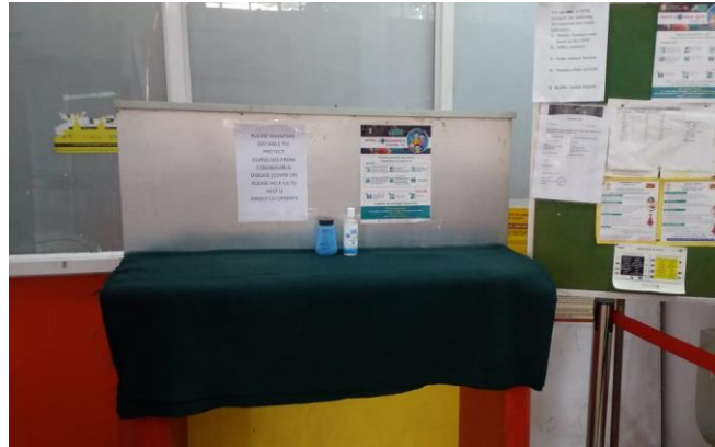
Pic 8: Sanitizers in public space at post offices