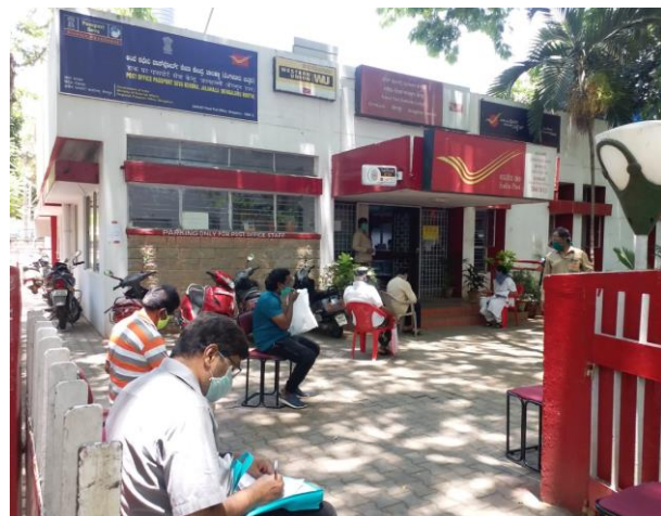
Pic 3: Customer queue outside office maintaining physical distance