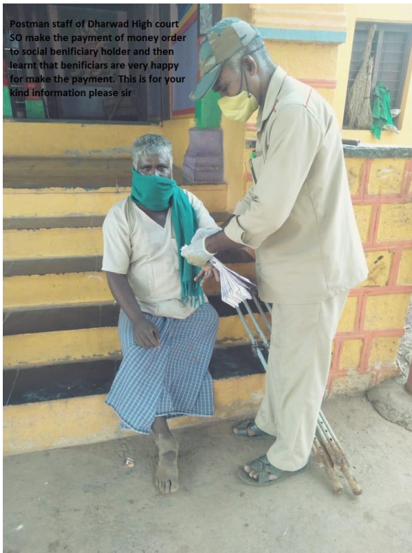
Pic 4: Payment of Social Security Pension MO

5. Postman can come back same day. If he leaves it to village GDS or BPM, he can come back immediately or act as dropping agent to go to next place. In that case, he can collect the list and unpaid amount next day.