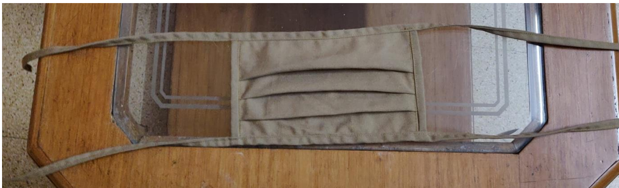
Pic 6: Mask stitched out of uniform cloth at PSD

Jails started producing masks and our officers contacted jail authorities and purchased masks from them. Many contacted local NGO and Mahila Samaj and got masks stitched by providing the old uniform cloth lying in stock. All kinds of efforts were made to ensure safety and security. The following visit reports of PMG BG Region show the slow return to normalcy as far as postal services is concerned.