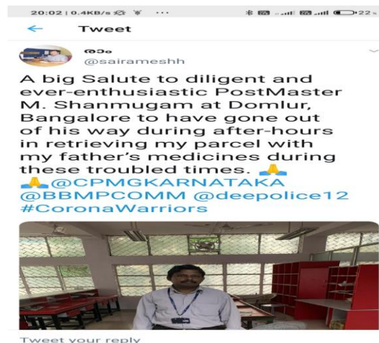
Pic 12: Customer appreciation