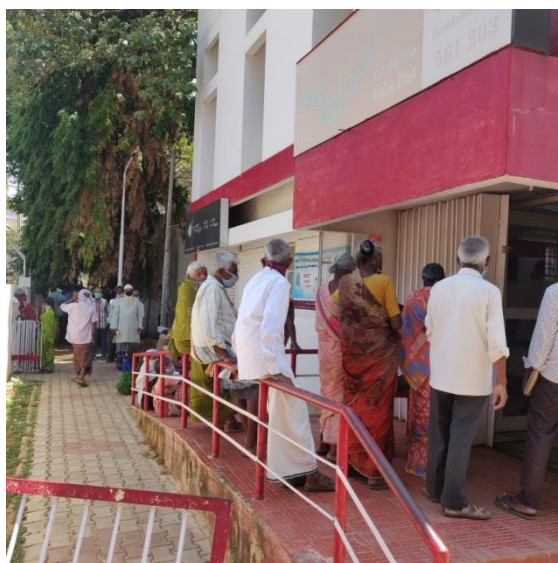
Pic 17: Doddaballapura – queue for DBT